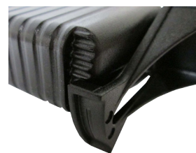
Close up of the ratchet clips

Mounting kit - sold separately 274-ULB9BKT